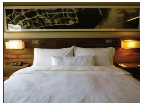
The Westin's trademarked Heavenly Beds are simply inviting.